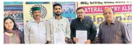
छात्रों के लिए इस प्रकार की उत्कृष्टता न केवल उनके करियर में सहायक होती है वह प्लेसमेंट इंटरनिंग और प्लेसमेंट ऑफिसर, रु