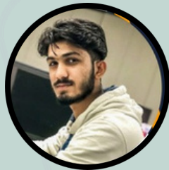
Navneet Amber Enterprises Ltd. Rajpura