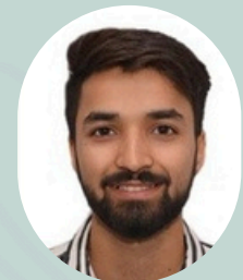
Rajat 1218 Global India Noida