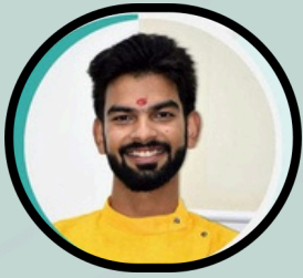
Sanket Auspicious Soft Pvt Ltd. Mohali